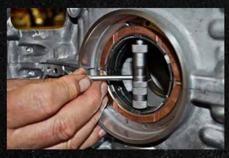
Assembled clearance can be confirmed using ACL Flexigauge (see ACL Engineering Bulletin EB003/2016).

Vertical oil clearance is best measured by assembling the bearing in its housing, with bolts torqued to specification, then using a bore gauge measure the assembled ID of the bearings at 90 degrees to the parting faces. The mating crankshaft journal size is measured and subtracting this measurement from the bearing ID bore size gives the assembled oil clearance.