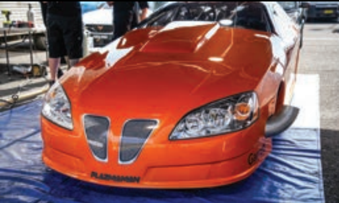
Bennett Motorsports, Pontiac GXP, 427 LS, Twin-turbo. Fastest LS powered vehicle in the Southern Hemisphere